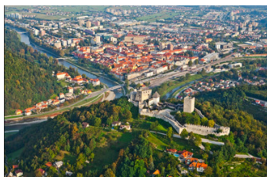
City of CELJE

Celje is another ancient-roman city in Styria. The city center with beautiful buildings and the remains of castle tells stories of an ancient glory of Celeia. There will also be a traditional "Cocktail party", which is one of the best events on the Slovenia trip. Guests will get the opportunity to meet a lot of new people and have fun with them.