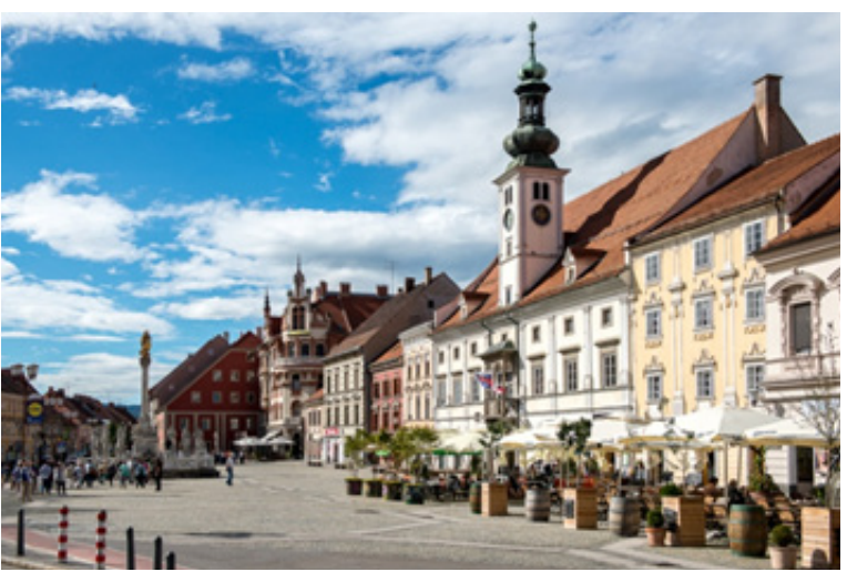
Main square in the city of MARIBOR

Maribor is the capital of Styria and the second largest city in Slovenia. Maribor lies at the foothill of Pohorje where the Golden Fox ladies alpine ski world cup takes place every year. In the time of the Slovenia trip, famous Festival Lent will take place on the bank of Drava River. Guests will have an opportunity to see the old city center of Maribor and the oldest vine in the world. Ptuj was built on the grounds of ancient – roman Poetovio and is the oldest city in Slovenia. With its ancient city center and historic castle, the city on the banks of Drava is certainly full of history.