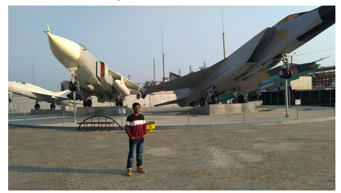
(Museum of Military Equipment)

Ekaterinburg Museum of Military Equipment has one of the biggest collections of military techniques which was used during WWII, next to it is the Museum of retro cars , where apart of retro classic is presented the collection of Soviet Cars and Motorbikes.