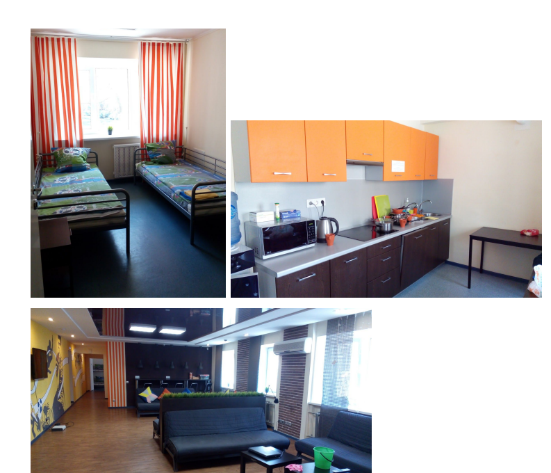
(Recreation zone, bedroom and kitchen)