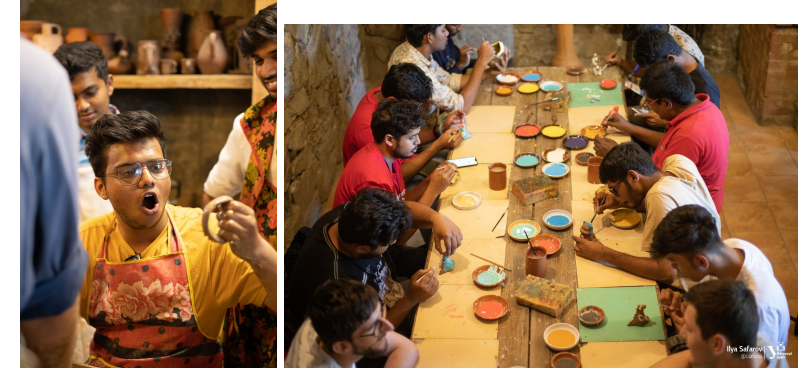
(Bell Melody festival)