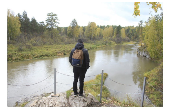
(Nature Reserve "Deer Springs")