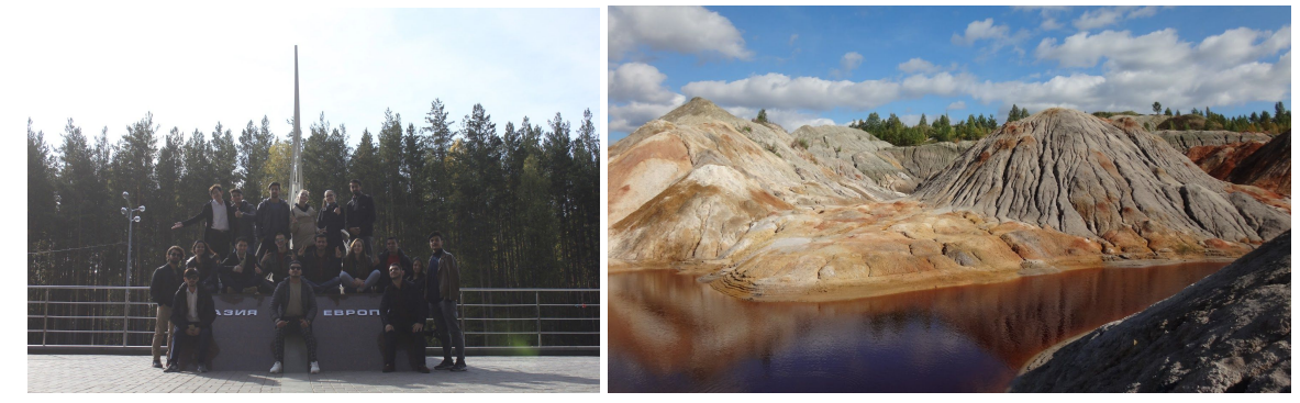
(The border of Europe and Asia)

Ural Federal University is based in Ekaterinburg – the 3rd biggest city in Russia, which is situated on the Border of Europe and Asia. Thanks to its geographical location Ekaterinburg surrounded by the breathtaking nature of Ural Mountains, this region is ideal for active sport lovers, who enjoy hiking, rafting, camping.