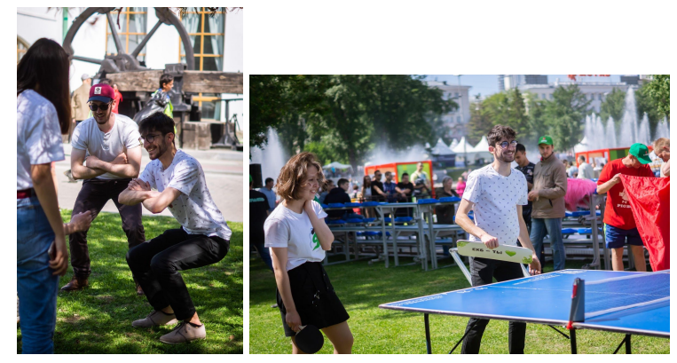
(Outdoor "BBQ fest" in the city centre)

However, the city lifestyle will suit anyone who enjoys vibrant life, over the summer Ekaterinburg has many outdoor festivals, open markets, and cultural events right in the city center. For the past 4 years Ekaterinburg has its own festival Ural Music Night , when it becomes a big music stage for bands from all over the world of different genres.