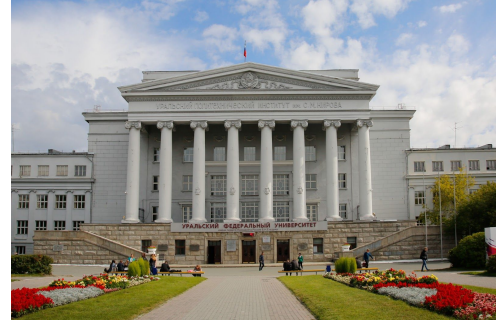
(Main Campus of UrFU) During our lectures we will be visiting the Campus.

The partner and organizer of this Program is Ural Federal University - one of the largest higher educational institutions in Russia. In October 2020 UrFU turns 100 years old. Within this century The University has achieved top positions in the World Rankings.