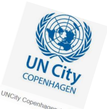
UNCity Copenhagen (@UN..