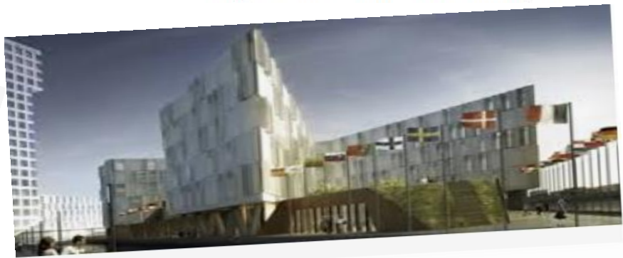
The UN City