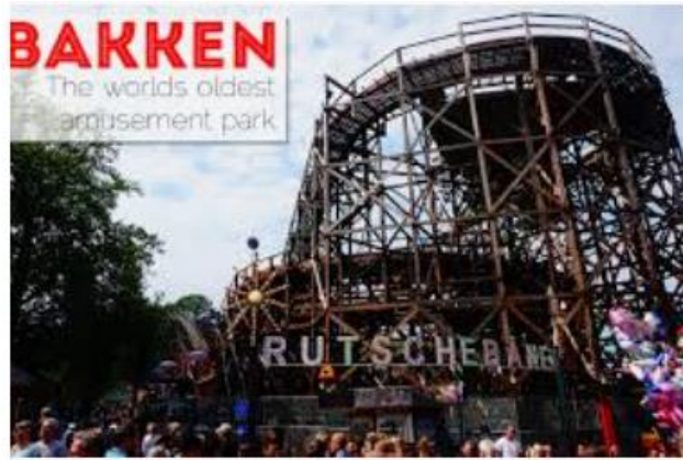
Visiting the worlds oldest amusement park - ...