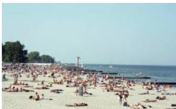
Bellevue Strand, Klampenborg