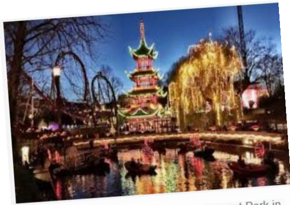
Visit the Tivoli Gardens Fun Fair Amusement Park in...