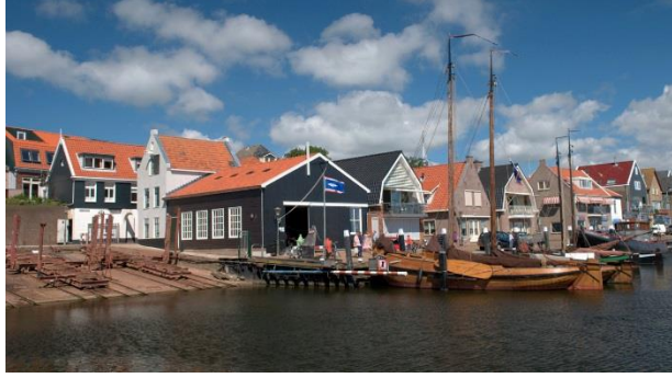
Where fishery is an important economic pillar