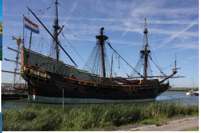
History in Flevoland: VOC Batavia