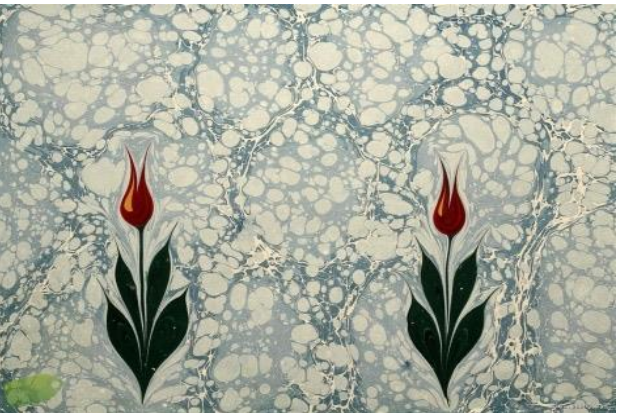
Glazed Tile Ceramics Painting Workshop