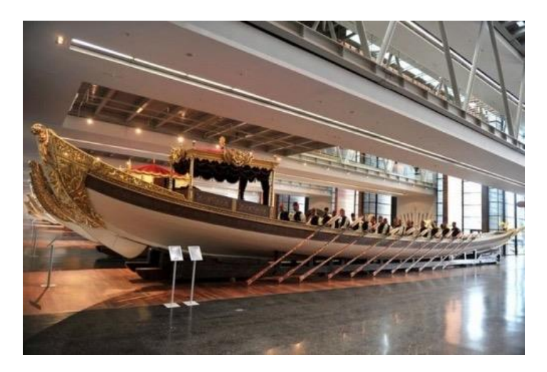
Museum of Marine