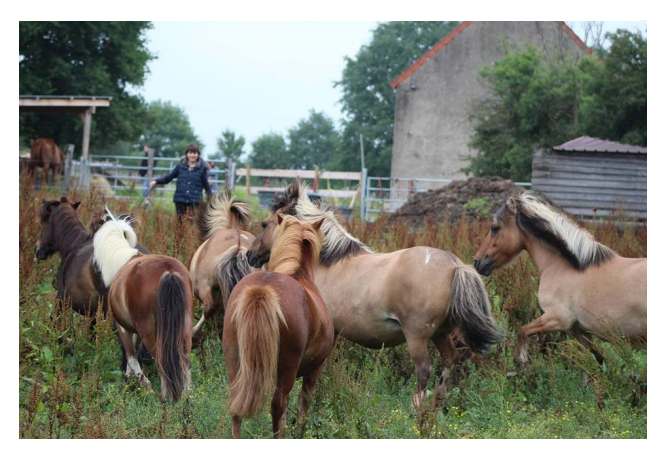
HORSES LIVE ALL YEAR ROUND

You will expect the unexpected in one of the best attraction park in Europe